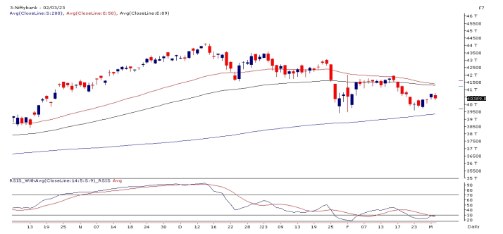
Exhibit 2: Nifty Bank Daily Chart

Looking at Wednesday's move, we expected some decent moves in the upward direction. But due to lack up follow up buying, it poured water on this promising attempt. Now although, the correction was a bit depressing, we continue to remain hopeful as long as 40000 - 39700 is being held convincingly. Hence, traders are advised not to lose hope and wait for a sustenance above 40800-41000 . Meanwhile, 40500-40700 are to be seen immediate hurdles.