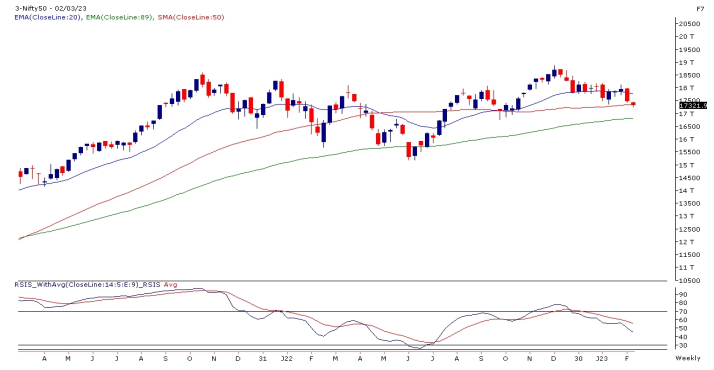
Exhibit 1: Nifty Daily Chart

As we advance, we advocate traders to keep a close tab on the mentioned levels and should focus on a stock-centric approach for better trading opportunities. Also, one should stay abreast with global developments.